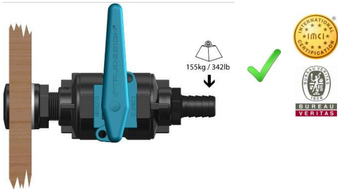
ISO 9093-2 Standard requirements.