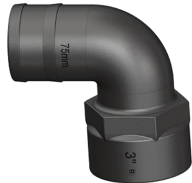
Tail 75mm 3" BSP Female 90°Bend