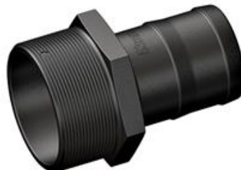
Tail 3" BSP, 63mm (2 1/2")