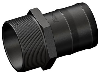
Tail 3" BSP, 75mm (3")