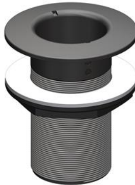
Skin Fitting / Thru Hull 3" BSP