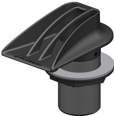
Intake Strainer 3" BSP – Thru Hull